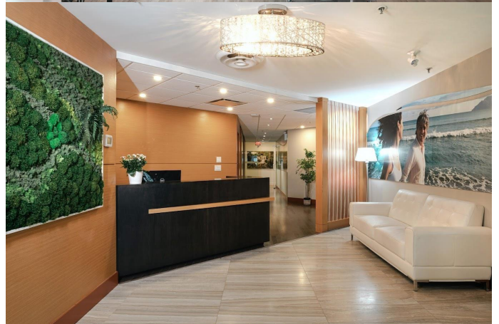
101A - 1440 GEORGE STREET WHITE ROCK, BC